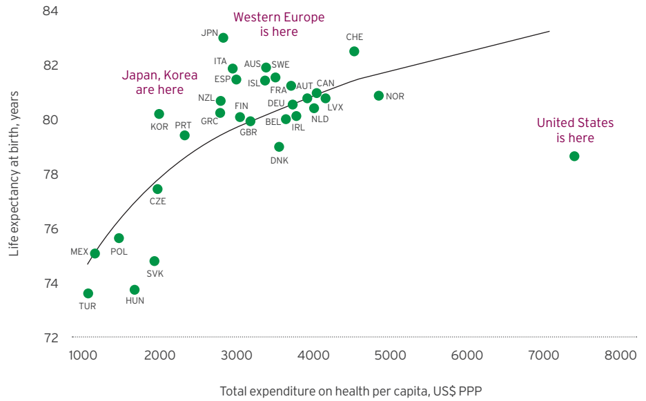
Figure 1. US healthcare spend appears unsustainable given macro-economic pressures

PPP = purchasing power parity.